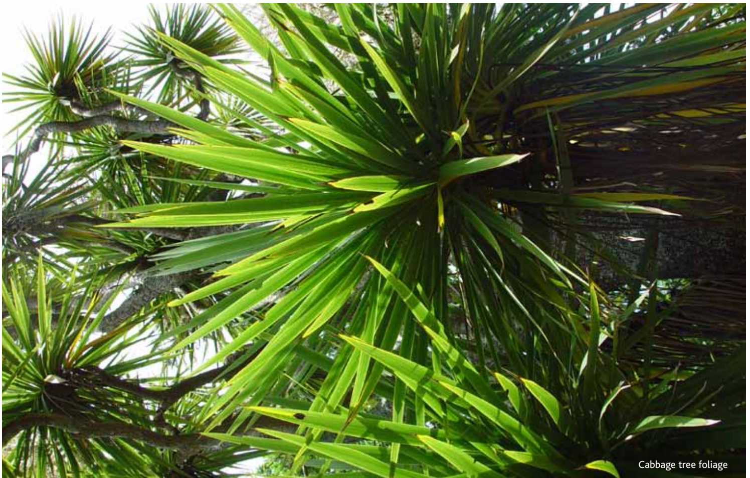
Cabbage tree foliage

Plant wetland species that grow in standing water and swampy ground at the end of summer, when the water levels are low.