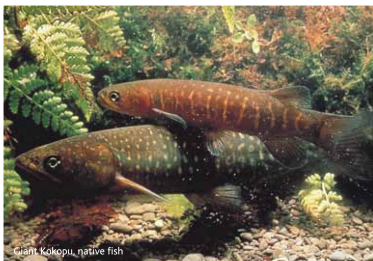
Giant Kokopu, native fish

The Auckland Council can provide further information on ecological restoration, pest plants and animals, consent requirements and funding opportunities. Contact Auckland Council 09 301 0101 or visit www.aucklandcouncil.govt.nz