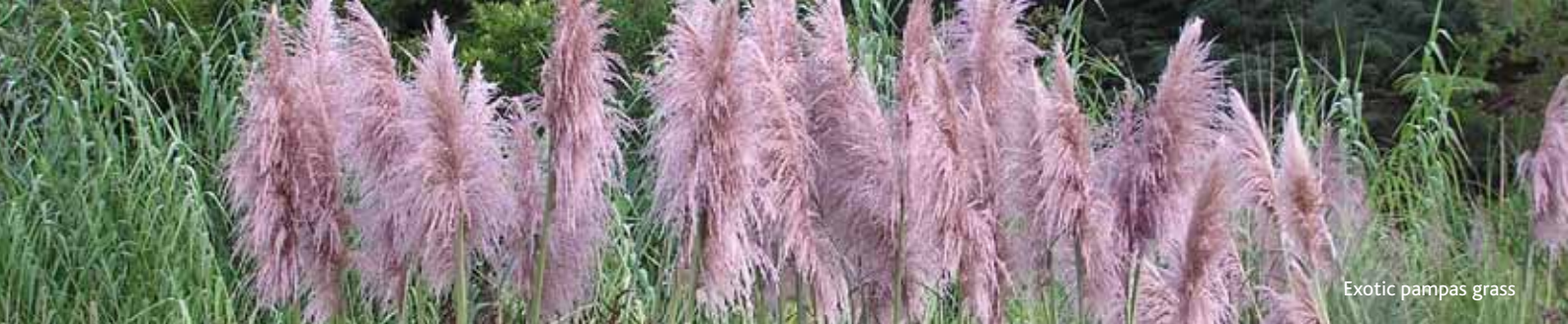
Exotic pampas grass

If you are restoring an existing wet area you may not need to plant many wetland species. Wetland plants will often establish naturally once water levels are restored and stock is removed. Nature will work its own magic!